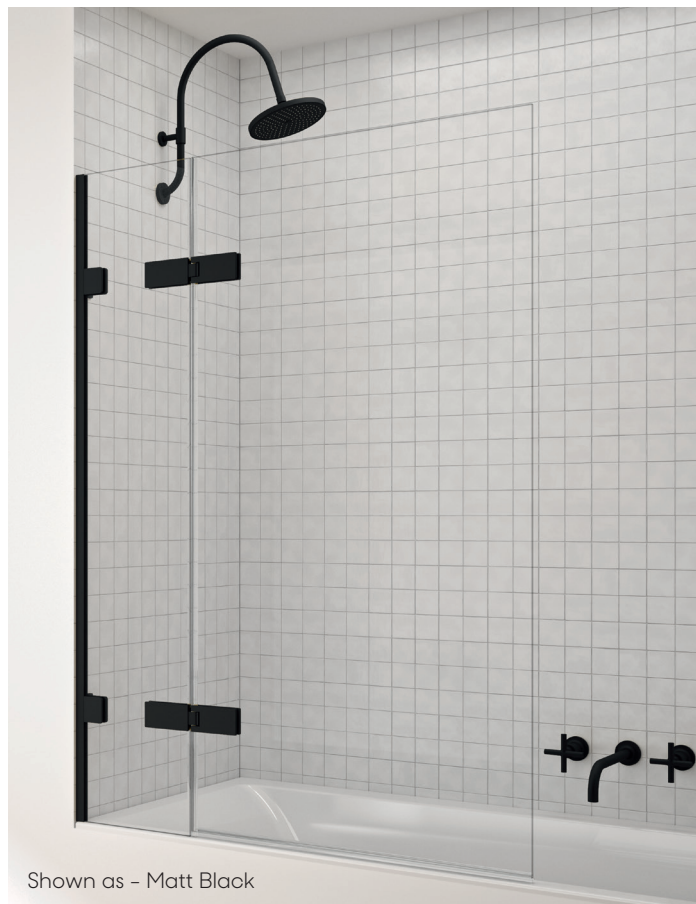
Shown as – Matt Black